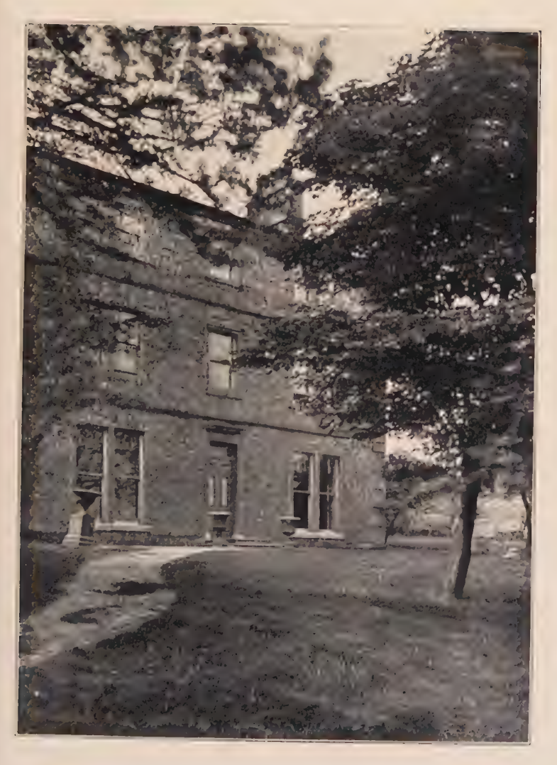
LAW HILL-FRONT (WUTHERING HEIGHTS)